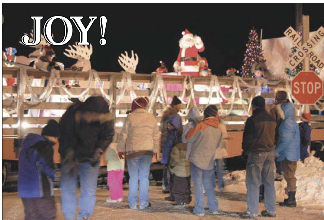
Good Neighbors

Santa Claus waves to those gathered at the Byrnes Street crossing as he and his entourage made their way to East Troy's village square aboard the East Troy Santa Parade Train. The train will return this year on Saturday, Dec. 6.