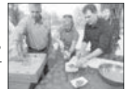
Bobby Flay at The Elegant Farmer

Citizens Bank of Mukwonago will celebrate the fifth anniversary of its East Brook branch office on Feb. 4. Watch for information about the festivities, which will include refreshments, prizes and an appearance by Billy Bear. For more information, call the bank at (262) 642-8456.