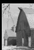
Siding • Barns