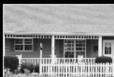
Roofing • Gutters