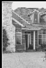
Windows • Single-Ply Roofs

James R. Taylor And Sons 3 Generations of Quality Work!