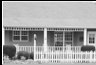
Roofing • Gutters