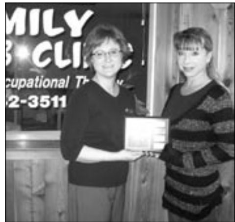
CHAMBER PHOTO Good Neighbors

We are a brand new apartment community located just off of I-43 on Highway 120 and Honey Creek Road. We have spacious floor plans ranging anywhere from 1,2 and 3 bedrooms. Call today to see your new home!