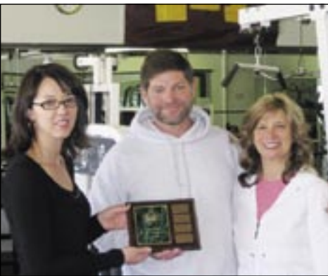
Good Neighbors