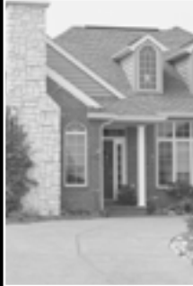
Windows • Single-Ply Roofs