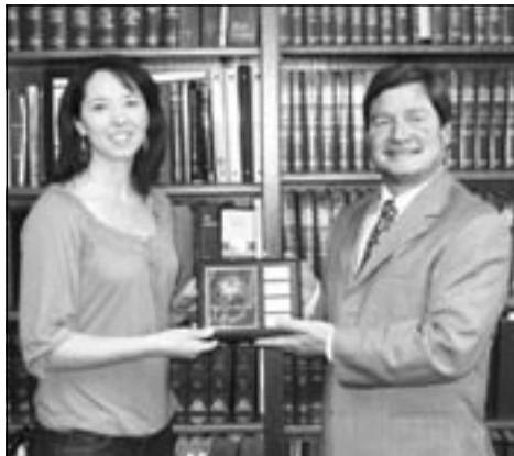
Good Neighbors

Good Neighbors is a publication of the East Troy Area Chamber of Commerce coordinated by the East Troy News and published four times per year in April, May, September and November.