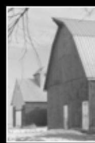
Siding • Barns