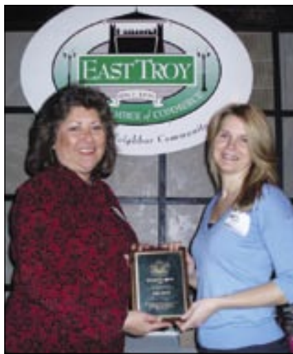
CHAMBER PHOTOS Good Neighbors