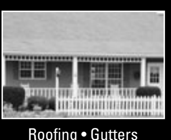
Roofing • Gutters

In the event of inclement weather the program will be presented in the High School Gym.