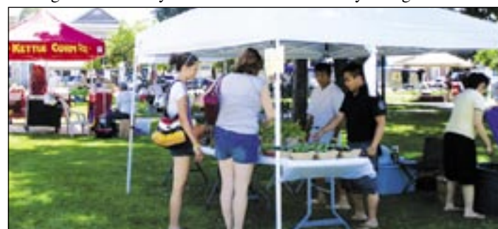
CHAMBER PHOTO Good Neighbors

Other area growers and artists interested in joining this group on Thursdays from 4 to 7 p.m. through Sept. 27 can register using a form available on the Chamber's website, www.easttroywi.org .