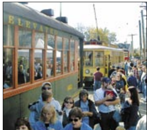
ETER PHOTO Good Neighbors

Area residents will have many opportunities this summer to ride the rails of the 105-year-old East Troy Electric Railroad, one of East Troy's most famous attractions.