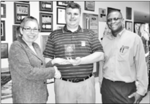
Good Neighbors

If you have any questions about the race, or can offer help as a volunteer, please contact the Chamber office at (262) 642-3770. Check out the Chamber website for updates at www.easttroywi.org .