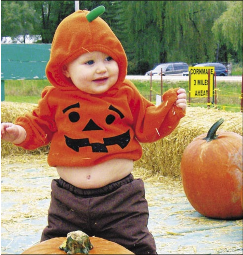
Good Neighbors

and discover this family-fun tradition. We welcome them all." The Elegant Farmer, Highways ES & J, Mukwonago, is open year round 8 a.m.- 6 p.m., excluding holidays. For more information, call (262) 363-6770 or visit www.elegantfarmer.com to shop online.