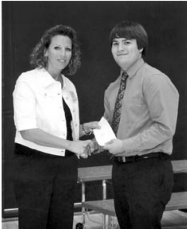
CHAMBER PHOTO Good Neighbors