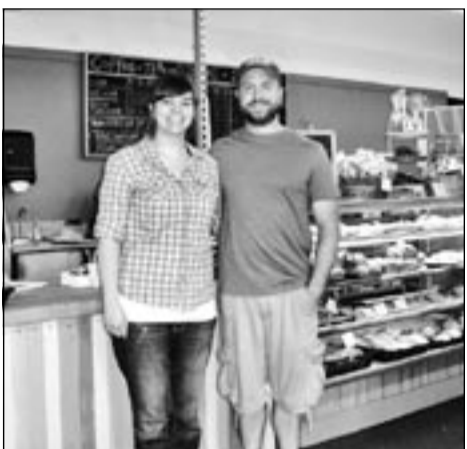
CHAMBER PHOTO Good Neighbors