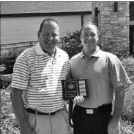
CHAMBER PHOTO Good Neighbors