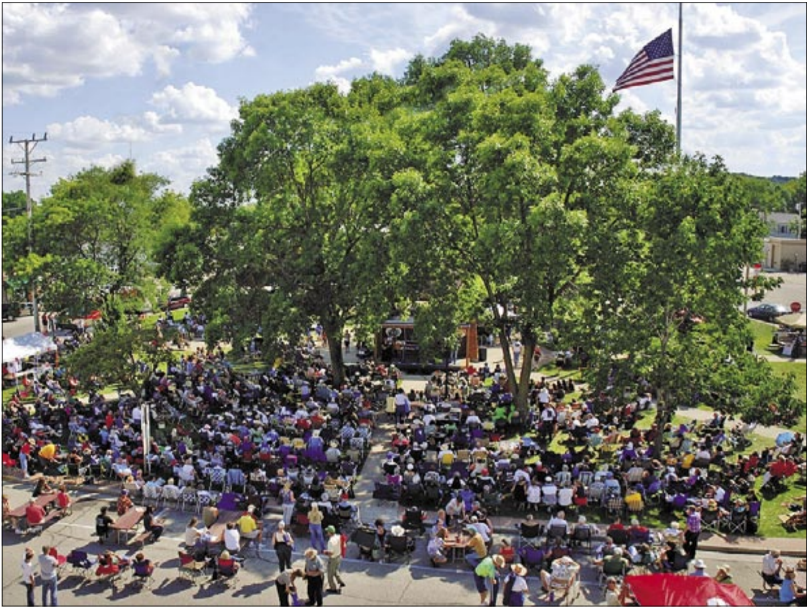
MIKE MORBECK Good Neighbors

6 p.m. at the Kubicki Museum and Heritage Center for walking tour of sites near and around the village square believed to house resident ghosts. $5 adults, $2 children under 12 accompanied by adult Scary movies at museum theatre from 6-9 p.m.