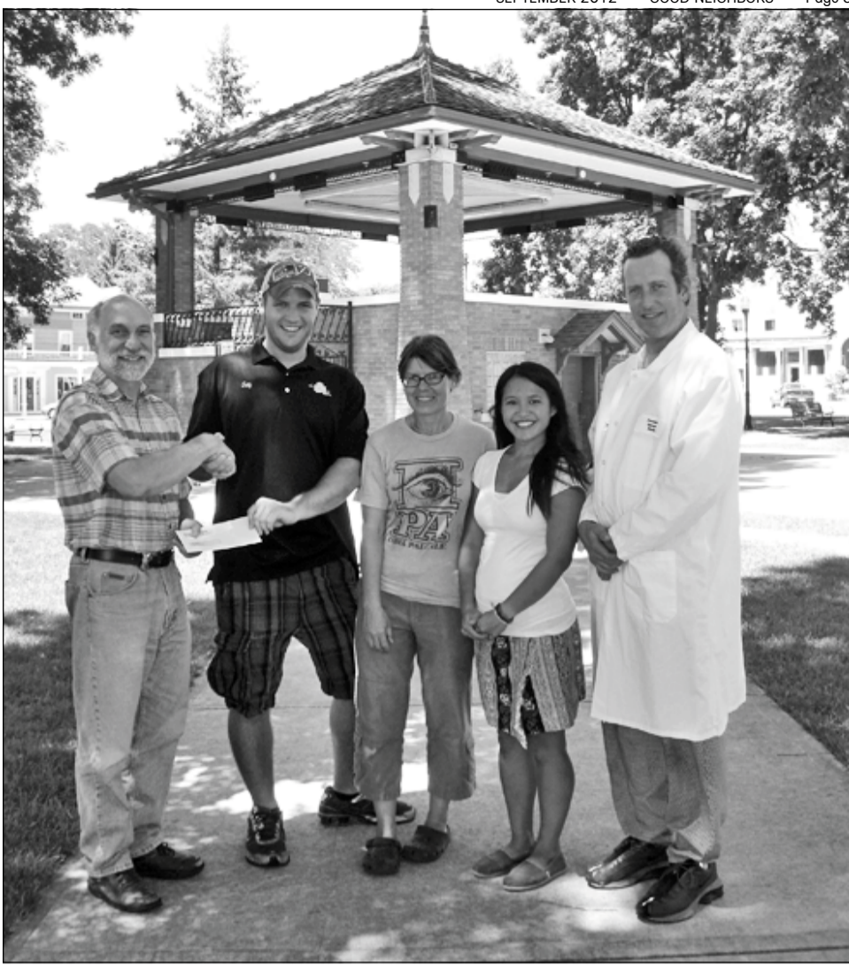
Good Neighbors