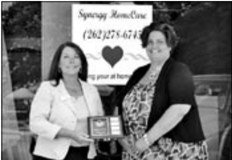
CHAMBER PHOTO Good Neighbors

Synergy HomeCare serves East Troy and the surrounding areas with non-medical at-home needs. Services include, but are not limited to, light housekeeping, med preparation, medication reminders and companionship to the elderly, hospice, rehab patients and those in need.