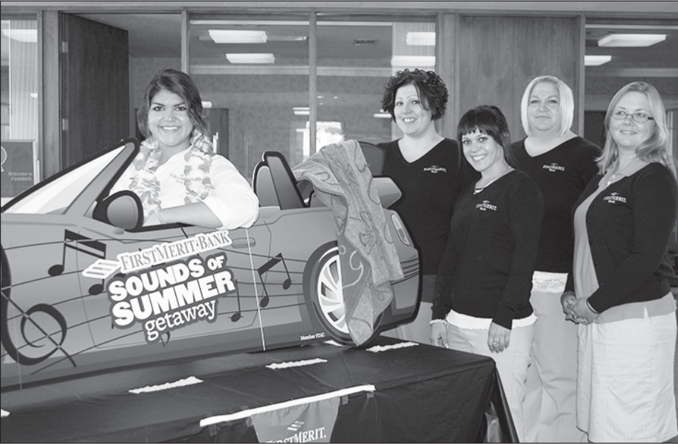
Good Neighbors