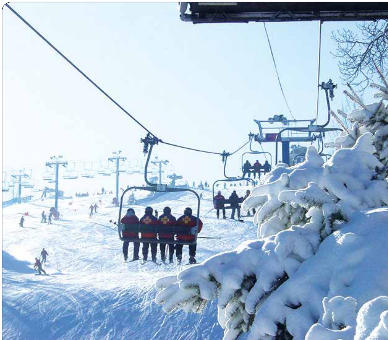
Skiers and snowboarders won't have to wait for the real white stuff at Alpine Valley Resort, which works hard each season to make its own winter wonderland.

Alpine Valley is located at W2501 County Road D and can be reached at (262) 642-7374 and (800) 227-9395. For more information, visit www.alpinevalleyresort.com .