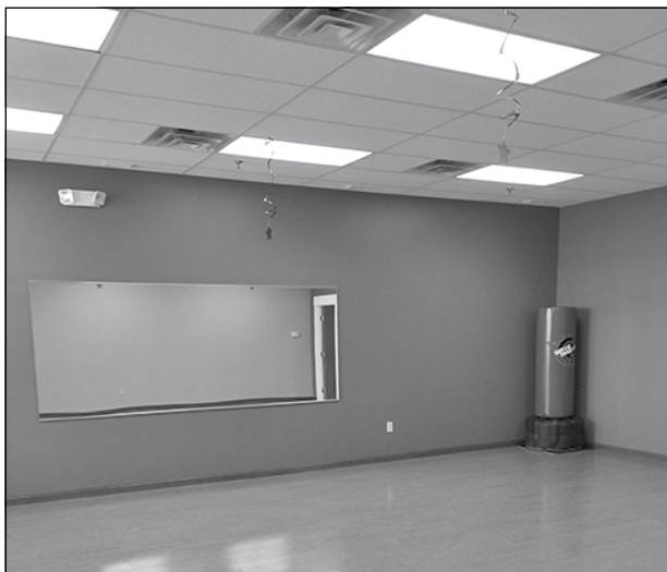
SUBMITTED PHOTO Good Neighbors

For more information, call (262) 642-1645.