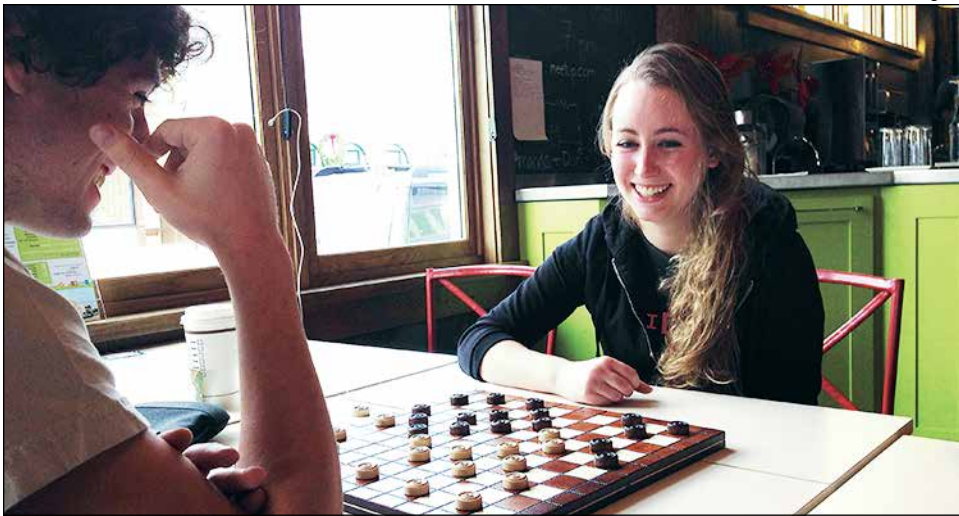
Good Neighbors East Troy’s newest café 2894 On Main was designed to be an easily accessible community hub, featuring a chess board, chalk message boards and a spot that welcomes meet ups for local groups like the East Troy Computer Club.

20. Plan to ride the East Troy Electric Railroad The East Troy Electric Railroad, 2002