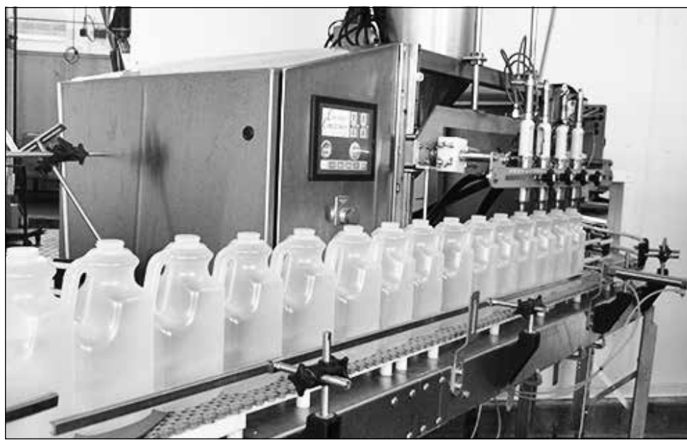
SUBMITTED PHOTO Good Neighbors

Gehl said it also helps with product develop-