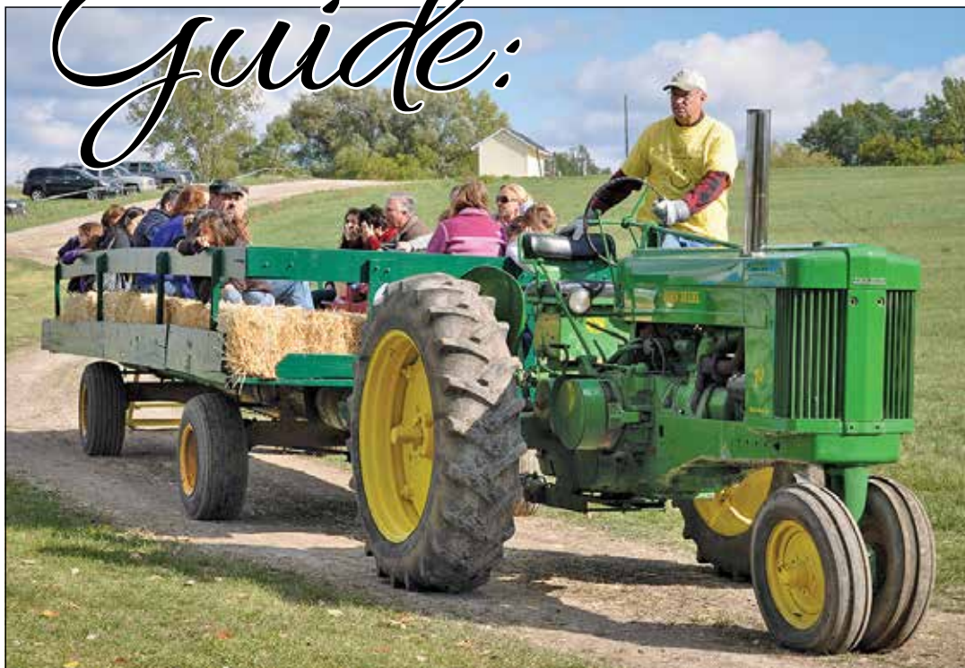
Good Neighbors

People will flock to the Elegant Farmer this fall during its popular family-friendly Autumn Harvest Festival Saturday and Sundays, Sept. 6- Oct. 26. Event favorites include tractor-pulled hayrides and strolls through 12 varieties of apple trees, offering pick-your-own fruits at its best (below).