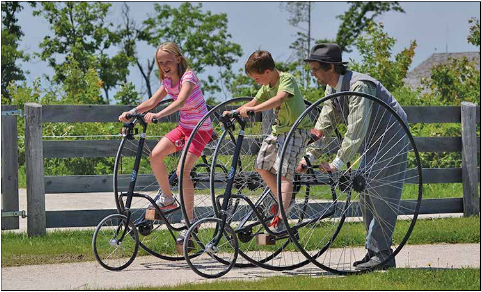
SUBMITTED PHOTO Good Neighbors

Old World Wisconsin's newest interactive experience, Catch Wheel Fever!, opened to the public this summer to great enthusiasm from guests. The hands-on experience, which continues through Oct. 31, captures the excitement of the 1890's cycling craze that swept the nation.