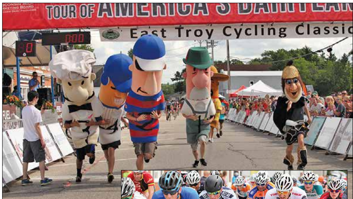
SUBMITTED PHOTOS Good Neighbors

Above: The Famous Milwaukee Brewers Racing Sausages will make a return appearance on the East Troy Village Square during the East Troy Cycling Classic Friday, June 19 from 4 to 5 p.m. Right: The criterium style race course on the East Troy Village Square and surrounding streets allows spectators to see cyclists whiz past every three minutes.