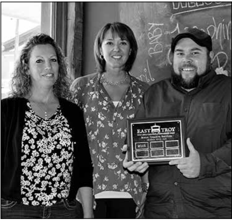
Good Neighbors