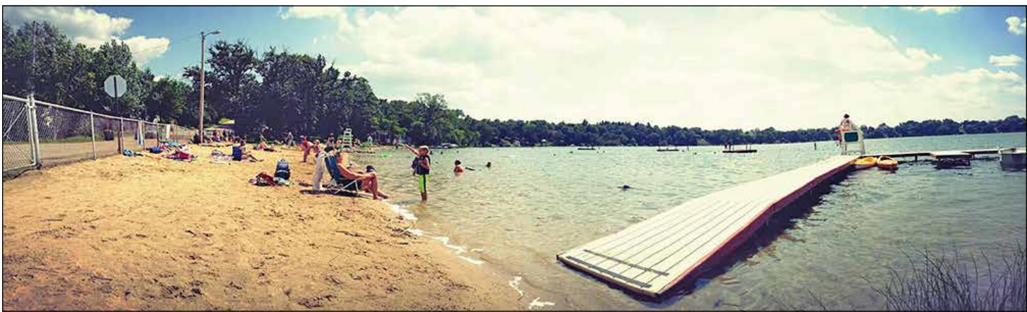
SUBMITTED PHOTO Good Neighbors

Kettle Moraine State Forest-Mukwonago River Unit: The 970-acre former Rainbow Springs property is situated in the Mukwonago River watershed and is an area known for its outstanding resource waters, including the 35-acre Rainbow Springs Lake, varied habitats and biological diversity. Directions: Visitors can park in lots on Highway LO, County Road J or County Road E.