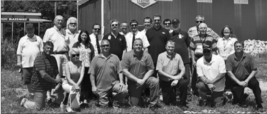
Good Neighbors

To make a donation to help fund the maintenance facility, visit www.easttroyrr.org . Major donors will be recognized on a wall of the new facility.