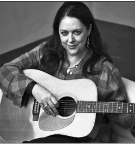
PHOTO SUBMITTED Good Neighbors Sunday's headliner at the East Troy Bluegrass Festival, Donna Ulisse, has "one of the most commanding voices in bluegrass music," according to Edward Morris, writer of CMT.com.

BLUEGRASS FOOD COURT VENDORS East Troy Area Chamber of Commerce – Soda, water, coffee East Troy Area Historical Society – Elegant Farmer caramel apples and pie Gus's Drive-in – Sprecher root beer floats The Grist Mill – Brats, hamburgers and hot dogs LD's BBQ - Pulled BBQ pork sandwich and chips Loomis-Martin American Legion Post 188 – Roasted sweet corn Pops Kettle Corn – Kettle corn with the perfect blend of sweet and salty goodness