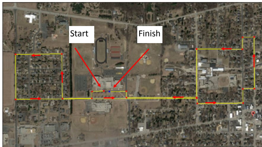
Good Neighbors The 3.1-mile Blast to the Past 5K will weave through downtown East Troy this year, starting and finishing on the lawns of East Troy High School.