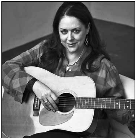
PHOTO SUBMITTED Good Neighbors Sunday’s headliner at the East Troy Bluegrass Festival, Donna Ulisse, has “one of the most commanding voices in bluegrass music,” according to Edward Morris, writer of CMT.com.

BLUEGRASS FOOD COURT VENDORS East Troy Area Chamber of Commerce – Soda, water, coffee East Troy Area Historical Society – Elegant Farmer caramel apples and pie Gus’s Drive-in – Sprecher root beer floats The Grist Mill – Brats, hamburgers and hot dogs LD’s BBQ - Pulled BBQ pork sandwich and chips Loomis-Martin American Legion Post 188 – Roasted sweet corn Pops Kettle Corn – Kettle corn with the perfect blend of sweet and salty goodness