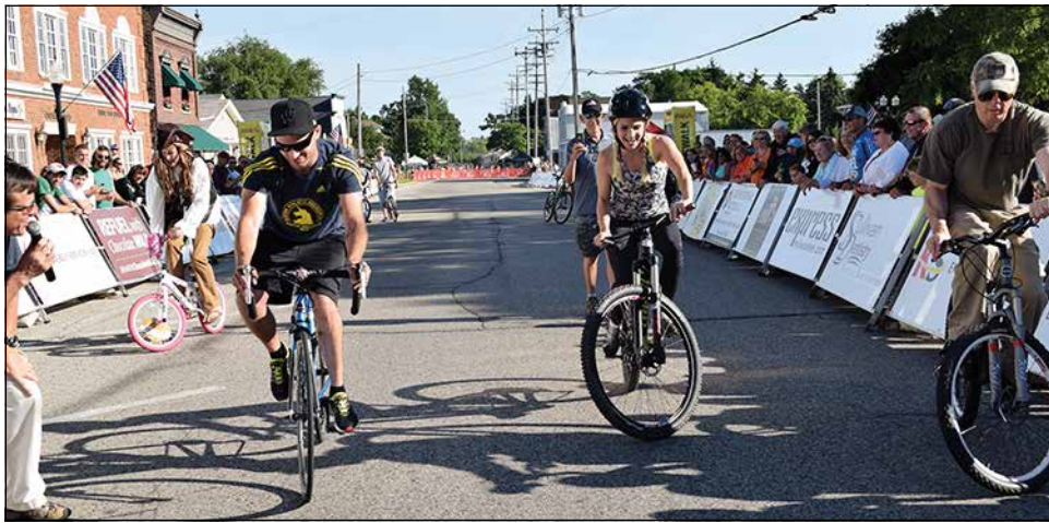
Good Neighbors