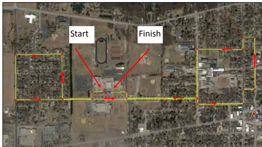
Good Neighbors The 3.1-mile Blast to the Past 5K will weave through downtown East Troy this year, starting and finishing on the lawns of East Troy High School.