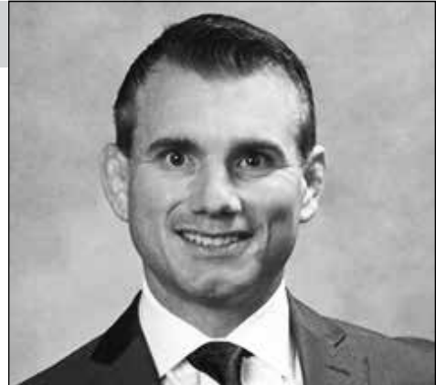
Good Neighbors

And when it comes to implementing solutions, the full capabilities of Northwestern Mutual are leveraged to provide exclusive access to a comprehensive variety of products and services.