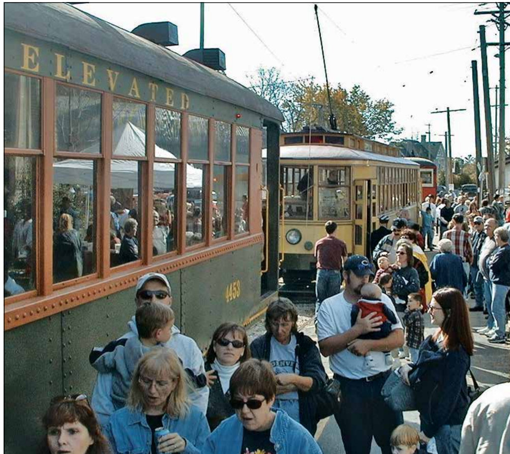
Good Neighbors

For a complete schedule, call (262) 642-3263 or visit www.easttroyrr.org .