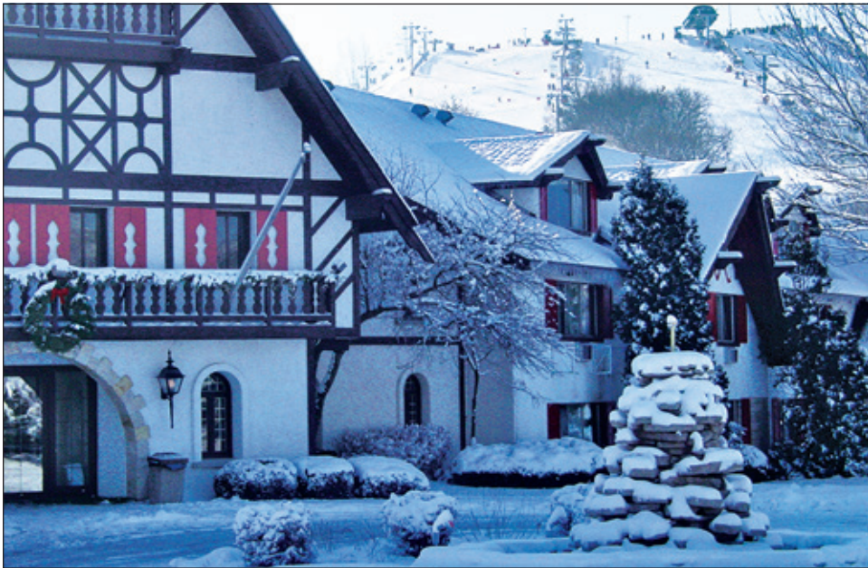
Good Neighbors

Alpine Valley is located at W2501 County