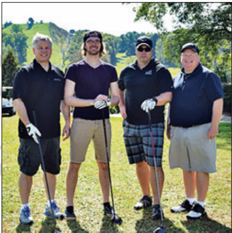
Good Neighbors