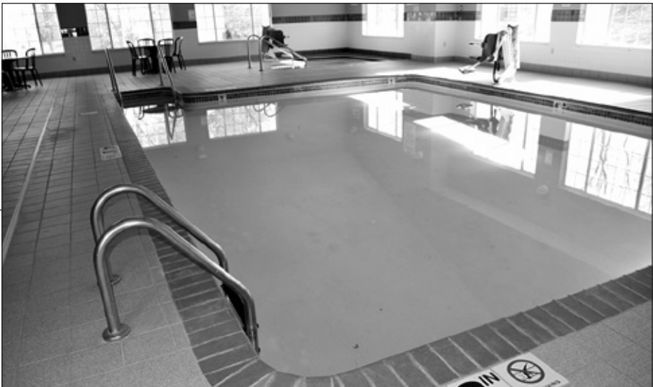
Top photo: After selecting a new franchise, the new owner of the Quality Inn and Suites has worked to completely renovate the interior of the property. Right: The newly remodeled pool is now open to the public.