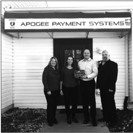
Good Neighbors