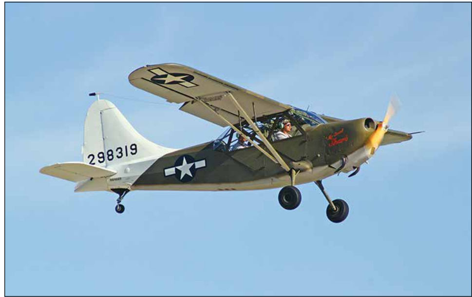
Good Neighbors Below: Tab-Air, based out of East Troy Airport, fully restored this World War II-era 1943 Stinson L-5, called the "Movie Star," because it appeared in the film "Catch-22." Below: The "Movie Star" flies over the California desert during training in 1943.