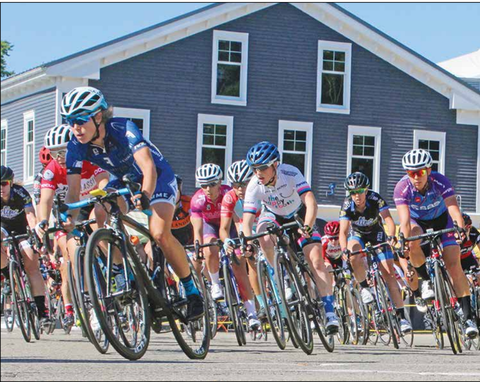
Good Neighbors

The East Troy Cycling Classic, part of the Tour of America's Dairyland, will return to East Troy Friday, June 16. The action-packed criterium style race course on the East Troy Village Square and surrounding streets allows spectators to see cyclists whiz past every three minutes.