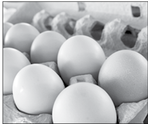
ABUNDANT HIVE HOMESTEAD PO Box 946 East Troy, WI 53120 abundanthivehomestead@gmail.com

Must-have market items: Custom blended essential oil rollers, handmade essential oil accessories, handcrafted Chakra pillars & pendants, hand carved walking sticks