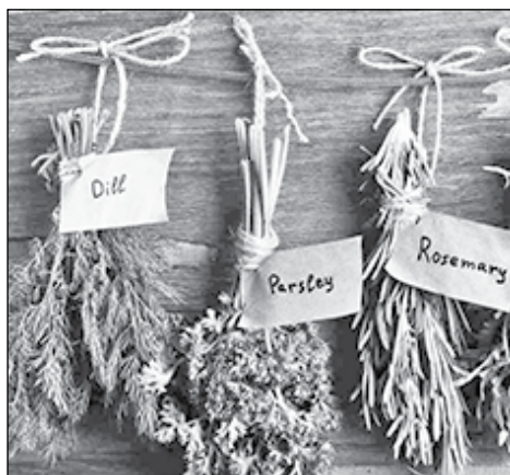
ADKINS HERBS N SUCH Lake Geneva, WI 53147 adkinsherbsnsuch@gmail.com

Adkins Herbs N Such will be selling everything from herb boxes to bath bombs to body scrubs to plants to veggies to flowers to its specialty – Hypertufa planters at area farmers markets. The Hypertufa planters were developed in the 1930s to replicate the stone troughs that were popular among English gardeners, feature beautiful flowers.