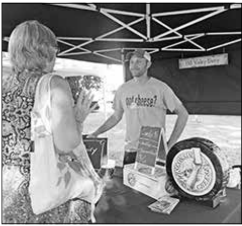
HILL VALLEY DAIRY (262) 684-9524 hillvalleydairy@gmail.com www.facebook.com/HillValleyDairy