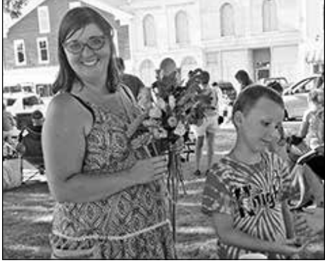
LOVELIGHT FLOWERS East Troy, WI 53120 (414) 510-5505 lovelightfloraldesign.com

Rohrganics produces vegetables and meat using strict organic practices. It grows for the community and for its farm store and café, Square Roots and 2894 on Main in East Troy. Rohrganics also offers vegetables by the pound, farm boxes, wholesale discounts, and whole/half animals. Must-have market items: huge variety of organic grown vegetables and fruits, free-range organic-fed eggs, pastured and organic-fed meat