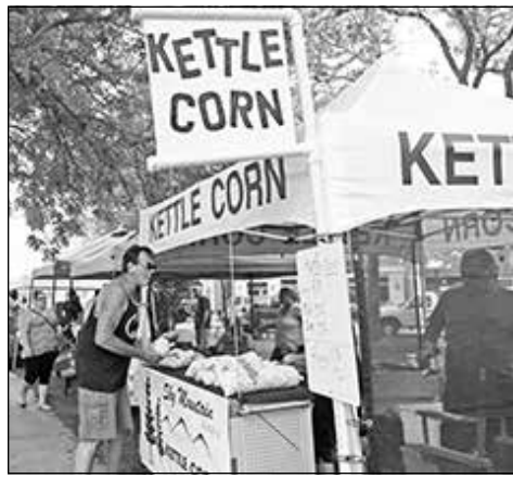
SKY MOUNTAIN KETTLE CORN (414) 430-5114 skymountain@sheeksters.net

Get to know our full season vendors, who will be joined by additional daily vendors every Friday!