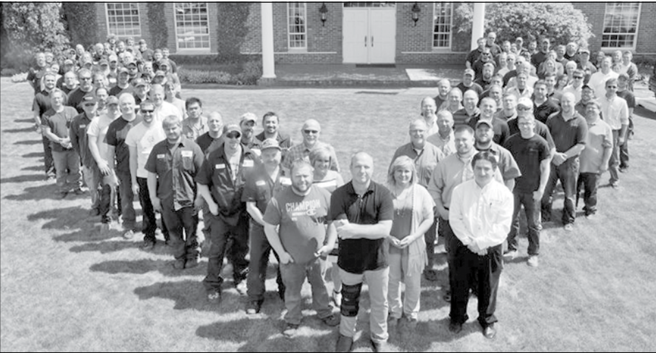
Good Neighbors Wisconsin Oven Corporation, known for promoting teamwork, leadership, and employee involvement, continues to contribute significantly to the economic growth of the region with the recent purchase of a 130,000-square-foot facility on Young Street.