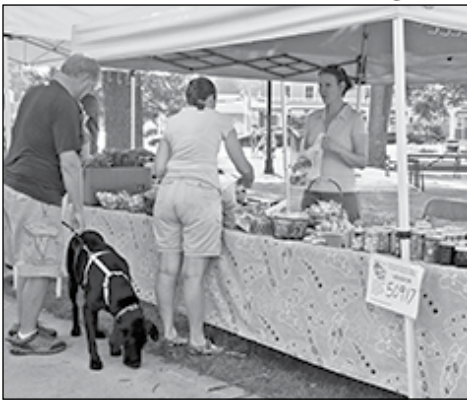
MUDDY BOOTS PLANT & PRODUCE Mukwonago, WI 53149 (414) 690-2436 muddyboots@wi.rr.com

Must-have market items: Natural goat milk soap, lotion butter, beeswax lip balm, 100 percent soy candles, maple syrup, Farmer John cheese, crocheted dishcloths, scrubbies, purses & towels