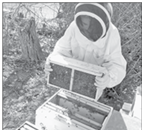
V&K HONEY W254 S10720 Hunters Run Mukwonago, WI (262) 993-2483 pradosevich@gmail.com

Must-have market items: plants, veggies, herb boxes, flower boxes, bath salts/scrubs/bombs