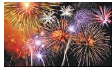
Good Neighbors

American Legion Loomis-Martin Post 188 will present a Memorial Day Observance on Monday, May 29. The parade begins at 10:30 a.m., beginning at the intersection of Beulah Avenue