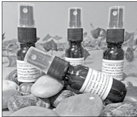
SARAH'S ESSENTIAL AROMAS East Troy, WI 53120 sarahsessentialaromas@gmail.com

Must-have market items: Spring garden seedlings, some perennial plants, garden veggies, fresh herbs, farm & garden craft items and decorations, jams & canned veggies and more