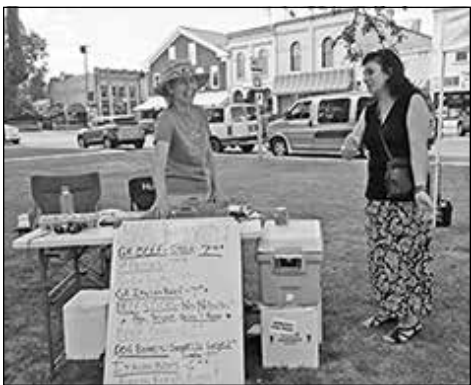
HEALEY'S WHOLESOME HAVEN W1838 St. Peter's Road East Troy, WI 53120 • (262) 642-3677