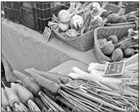
ROHRGANICS 2894 Main St. • East Troy, WI 53120 info@rohrorganics.com www.facebook.com/rohrorganics