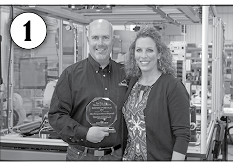
Allan ICS- 2016 Business of the Year