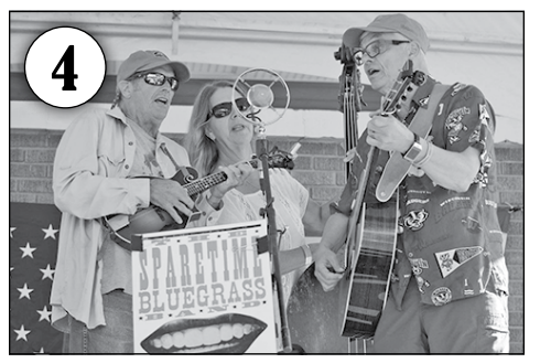
23rd annual East Troy Bluegrass Festival