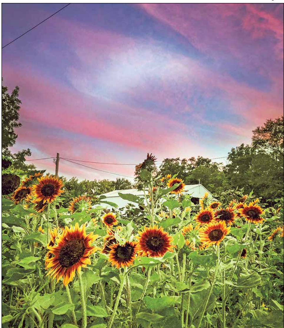
LOVELIGHT FLOWERS Good Neighbors