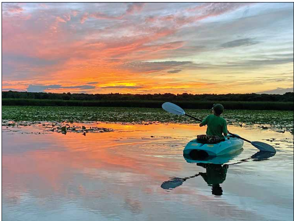
DAVE MROCH Good Neighbors