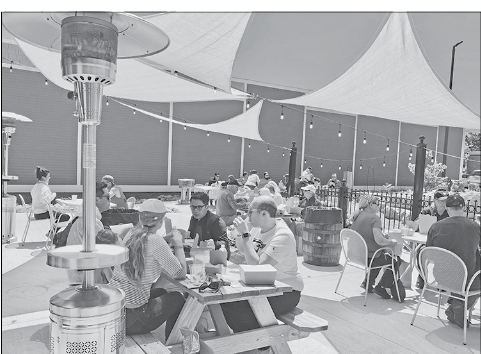
East Troy Brewery offers a laid-back, family-friendly space to unwind from the daily hustle. This fall, enjoy a seasonally-evolving menu paired with house-brewed beers by the fireplace lounge, the taproom, indoor dining area or outdoors on the patio.

Lulu Lake: The focal point of the diverse wetland and upland communities, located on County Road J, is the 95-acre Lulu Lake, a 40-foot deep, hard water drainage kettle lake