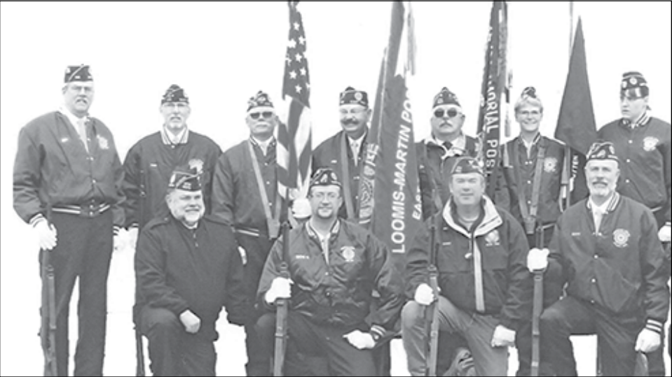
Members of Loomis-Martin Post 188 American Legion are raising funds for the Legion hall, which dates back to the early 1900’s and is in need of numerous repairs, including a new roof and new windows.