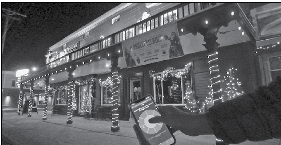
East Troy Lights is an interactive holiday light show taking place throughout the month of December with help from a $19,225 Joint Effort Marketing (JEM) Grant from the Wisconsin Department of Tourism. Not only can you watch the shows - on the hour, every hour - but, with the help of a mobile phone, you'll be able to try your hand at making your own light show.

Visitor spending in Walworth County alone increased to $584.5 million supporting more than 7,000 jobs, creating $69.4 million in state and local taxes and generating a total impact of $784.9 million in sales for businesses in the county.