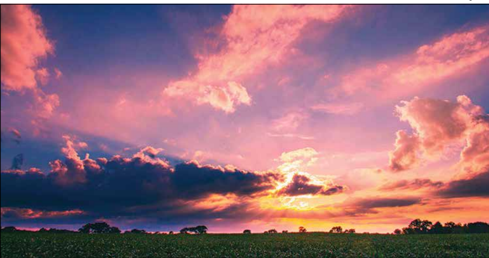
DAN JOERRES Good Neighbors