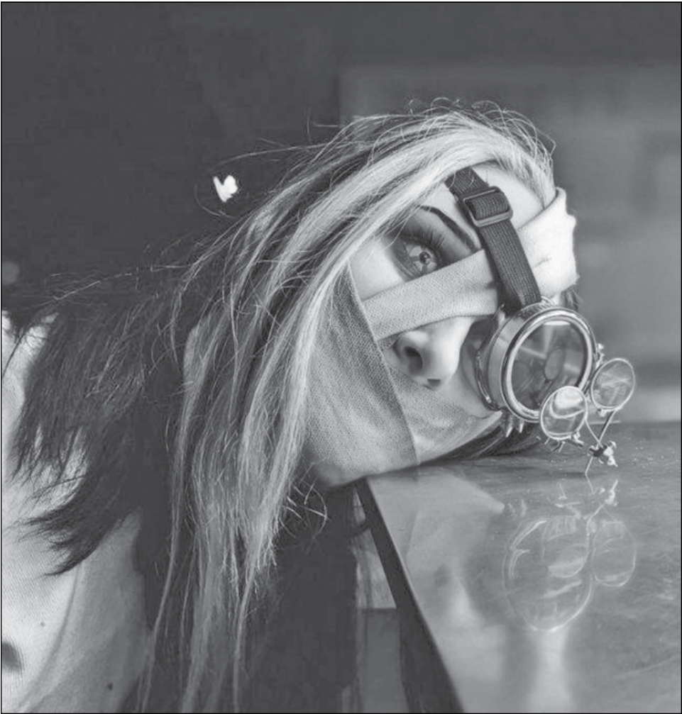
The Walk of Terror, East Troy’s scariest Halloween attraction will return to the Amusement Park on weekends for the entire month of October. For details, visit thewalkofterror.com.

Good Neighbors