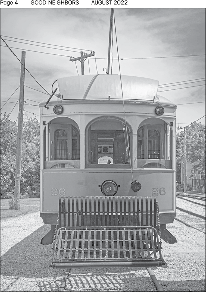
East Troy makes it easy to make the most of the fall season. top right: The Elegant Farmer's Harvest Festival features a corn maze, apple picking, hayrides, apple cider donuts and more. top left: The East Troy Electric Railroad, one of East Troy's most famous attractions, will offer weekend rides through Oct. 30.