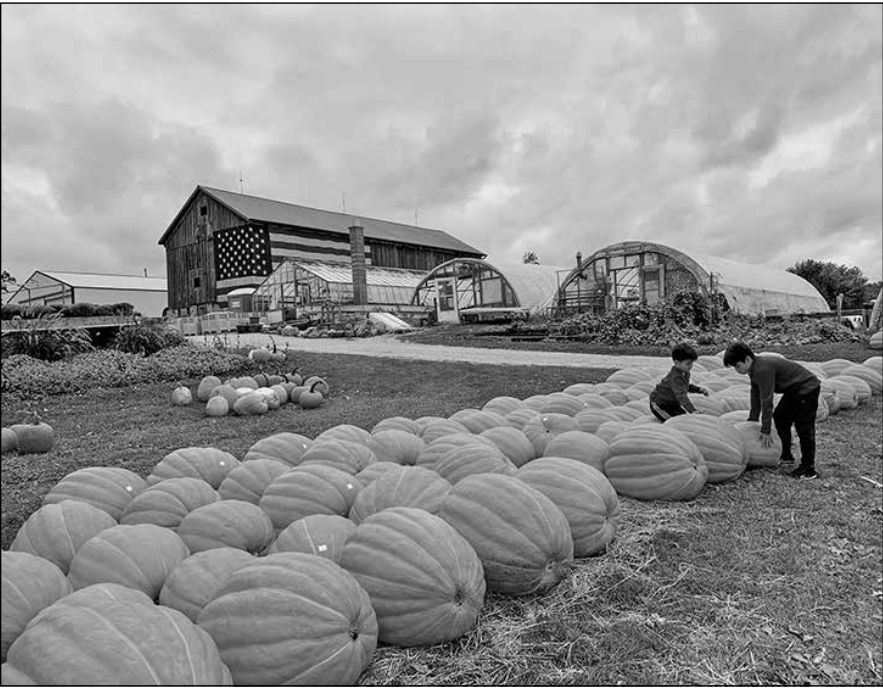
What better way is there to enjoy the change of seasons than stocking up on pumpkins and produce at Bowers Produce, W490 WI-20.