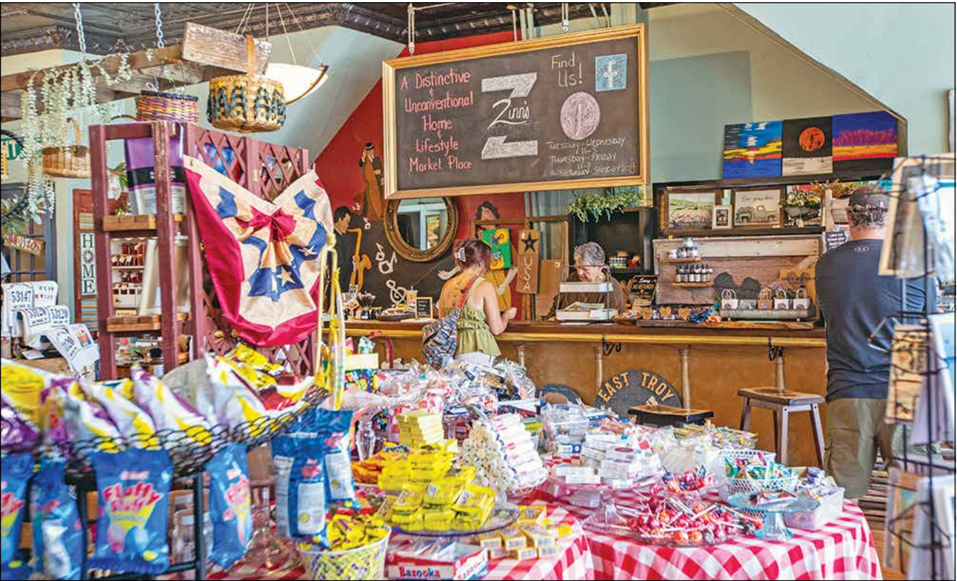
Zinn's on the Square puts focus on curating goods made by local artisans.