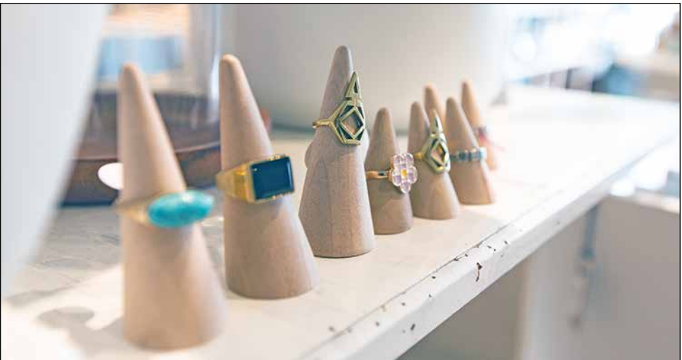
Showcasing a mix of big city and Wisconsin brands, Home on the Square offers a beautiful high-low blend.