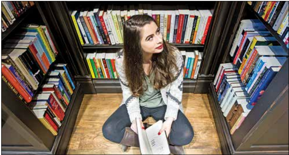
InkLink Books, East Troy's first bookstore, celebrated its fifth anniversary July 5, and has become a destination for shoppers visiting the East Troy Village Square.

"My preference is for people to do the hunt," Rohrer explained. "A lot happens when you do that. It's inevitable that you find something you didn't know was out there. It's exciting." The building, which dates back to 1862 has been completely transformed into a chic yet comfortable space filled with beloved titles of every genre. As you enter, you are surrounded by floor to ceiling books, a rolling ladder, fireplace and attractive window displays. Murals of goddesses of wisdom adorn the walls and ceiling. Open Tues.-Sat. from 10 a.m. to 1 p.m.