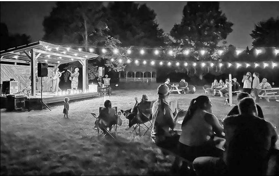
The Hive Taproom is buzzing with events this fall, featuring live music every Saturday night, Thursday Night Trivia, Brewery Tours and more.