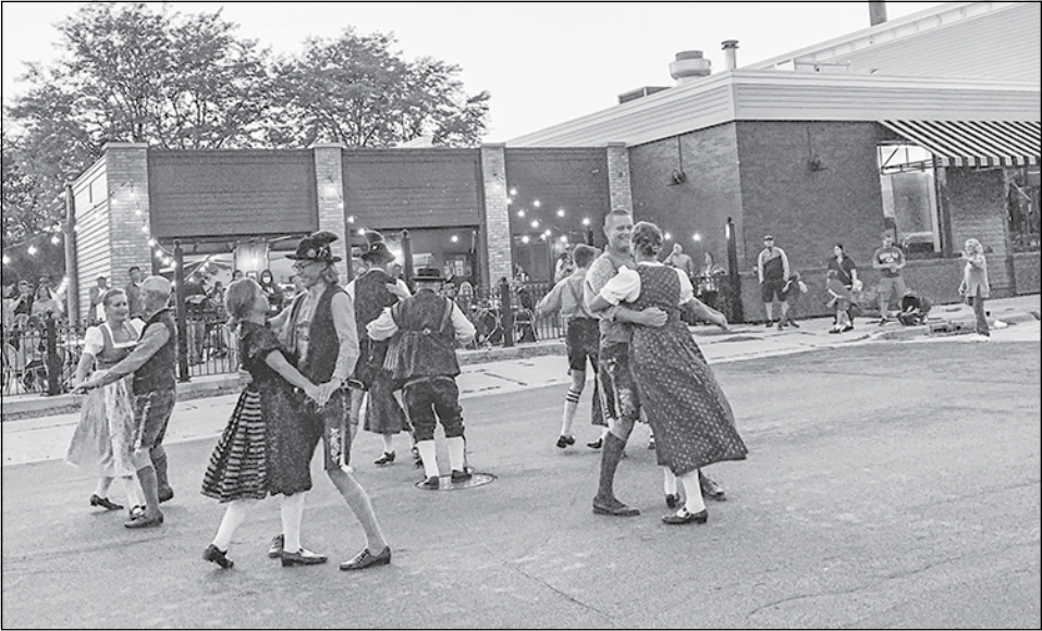
East Troy Brewery will be hosting its annual Oktoberfest event on Saturday, Sept. 17 featuring a special Oktoberfest beer release, German Dancing by D'Oberlander and more.