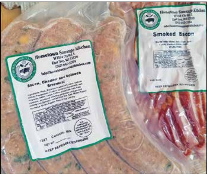
Good Neighbors