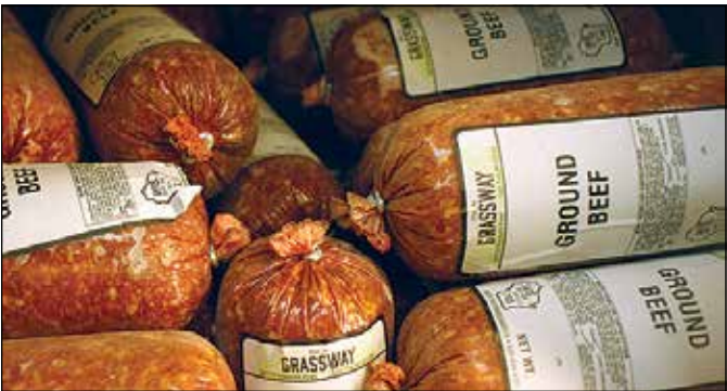
Good Neighbors