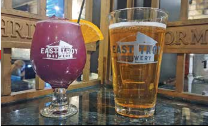
NINA ZEISS Good Neighbors

East Troy House's diners are hooked on its Seafood Nachos featuring tortilla chips, shrimp, scallops, cheddar jack cream sauce, pico de gallo and sour cream. Visit easttroyhouse.com for details.