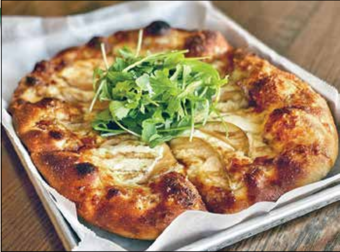
NINA ZEISS Good Neighbors

You can't go wrong with East Troy Brewery's top-selling items – White Truffle Pear Pizza, featuring garlic parmesan white sauce, fresh mozzarella, anjou pears, arugula, white truffle oil & balsamic syrup, as well as Helles of Troy lager and Strawberry Wine. Visit etbrew.com for details.