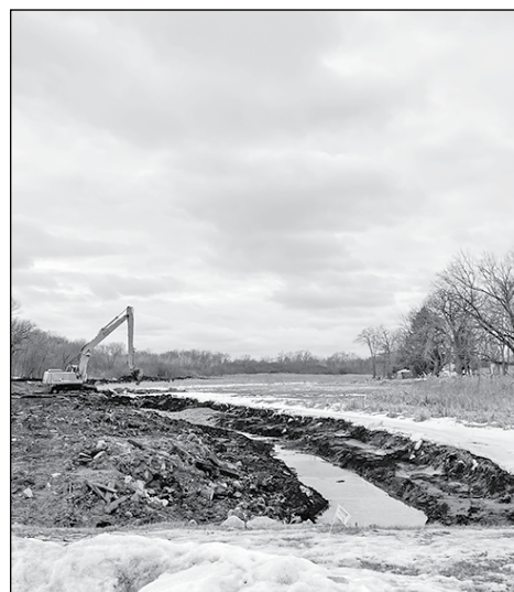
The work to remove the dam on the east side of East Troy Lake is now taking shape. VANESSA LENZ Good Neighbors

Officials are currently removing the dam that holds back Honey Creek on the east side of the 29-acre East Troy Lake. The project consists of the removal of the existing dam, grading the river channel, eradication of existing vegetation and establishment of native plantings, according to the Village of East Troy. The East Troy Village Board Officials decided to remove the dam rather than repair the dam, in August of 2018. The board's decision came after a year of debate over what to do with the dam at Highway 120 and Buell Drive after it was damaged during the flooding in July 2017.