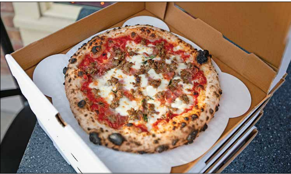
Sauced Pizzeria has thrived on the East Troy Village Square serving up locally sourced, seasonally inspired, 100% wood fired Neapolitan style pizzas.

the pizza making process, following precise processes for ingredients and preparation. At the 100 percent wood-fired Neapolitan style pizzeria, you'll find favorites like a Margherita with fresh mozzarella, the crowd-pleasing Prosciutto Verde and Carne, as well as a variety of house-made, organic gelato. The fan favorite restaurant is located at 2886 Main St. and features outdoor seating. Visit getsauced.pizza for more information.