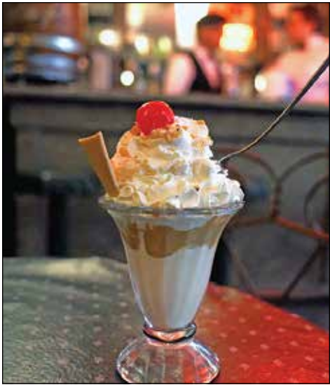
Lauber's Ice Cream Parlor Dusty Road

Step back in time with a summertime trip to J. Lauber's Ice Cream Parlor, 2010 Church St., East Troy for a Dusty Road. The creation features two generous scoops of vanilla ice cream, covered with hot fudge, dusted with malted milk powder, topped with whipped cream, crushed nuts and a cherry. You can also choose from a four-page menu of traditional treats, ranging from fountain soda to 20 flavors of malts or selections from an old-fashioned candy counter. For more information, call (262) 642-3679.