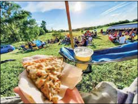
Grassway Organics, W2716 Friemoth Road, will host Pizza on the Farm on Fridays and Saturdays May 6 through Oct. 1. Orders are taken from 4-8 p.m. on Fridays, and 2-8 p.m. on Saturdays. The music starts at 4 p.m. For a full schedule and updates on live Pizza on the Farm events, visit grasswayorganics.com .

Grassway Organics, W2716 Friemoth Road, in East Troy, hosts Pizza on the Farm events on Friday and Saturday nights, May 6 through Oct. 1, baking pizzas using only organic ingredients on the farm's on-site wood fired pizza oven. The series invites people to visit the farm for live music and fresh, drool-worthy wood-fired pies. Pizza is served rain or shine from 4 to 8 p.m. on Fridays and 2 to 8 p.m. on Saturdays. For more information, visit grasswayorganics.com .