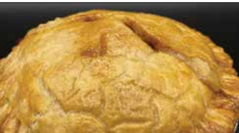
Kelly's Pot Pies and More

For more information, visit elegantfarmer.com.