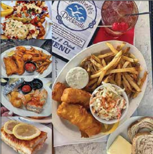
Lulabell's Dockside Fish Fry

Call (262) 642-5264 to place your order or reservation today. For more information, visit lulabellsdockside.com.