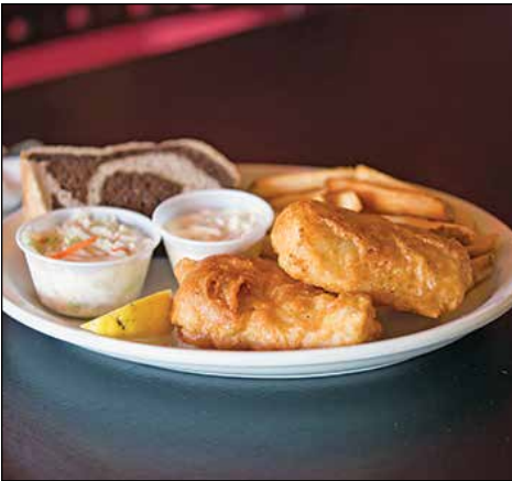
East Troy House Fish Fry

To make dining reservations or order carry-out call (262) 642-7100 starting at 11 a.m. For full menu, visit easttroyhouse.com.