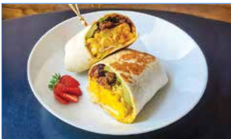
2894 on Main Breakfast Burrito

Order for pickup at The Venue, 2645 Main St., East Troy. For more information, visit kellyspotpies.com.