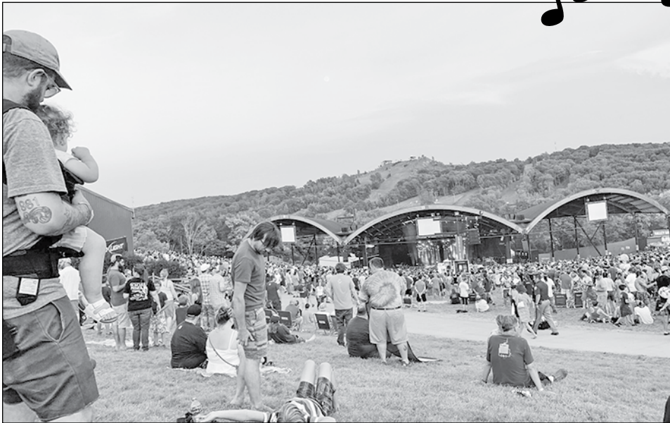
Alpine Valley Music Theatre, one of the largest outdoor amphitheaters in the country, will once again give fans the chance to see star-studded bands while surrounded by its signature hills this summer with its busiest season in 19 years.

June 16: East Troy Community Band June 23: Take Four Jazz June 30: East Troy Community Band Patriotic