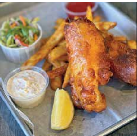
East Troy Brewery Fish Fry