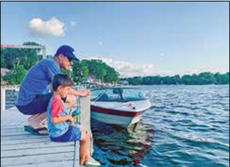
Lake Beulah is the largest lake in East Troy at 812 acres and is a favorite for boating and fishing.

Army Lake: The Army Lake public access point is located at W1698 St. Peter's Road, featuring 989 feet of shoreline frontage. The 78-acre lake with a 17-foot maximum depth and an average of 8 feet, features fish like Panfish, Largemouth Bass and Northern Pike. Lake Beulah: At 812 acres, the largest lake in East Troy is a favorite for boating and fishing. It has a maximum depth of 58 feet. Fish include Panfish, Largemouth Bass and Northern Pike. The public boat access site is located on Wilmer's Landing in the Town of East Troy.