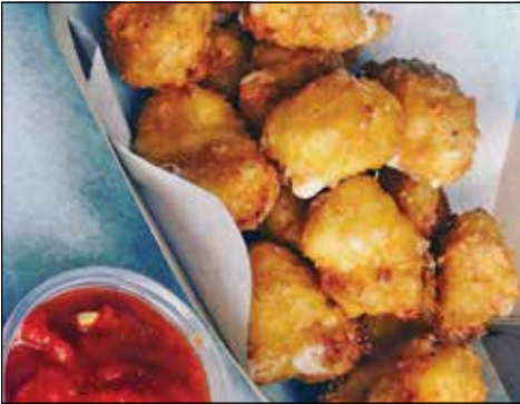
From its small batch, locally made cheese curds to its Friday Fish Fry to its 13-hour slow-smoked Texas-style brisket sandwich, East Troy Brewery uses fresh ingredients to make everything from scratch, each day.

Wisconsin cheese curds are a top menu item in America's Dairyland. Locally made from Hill Valley Dairy cheese, this bucket list item at East Troy Brewery is among the best in the state. Don't forget to wash them down with one of East Troy Brewery's house-made beers, along with a locally sourced menu with tasty options for the whole family. East Troy Brewery is located on the west side of the East Troy Village Square, 2905 Main St. For more information, visit etbrew.com .