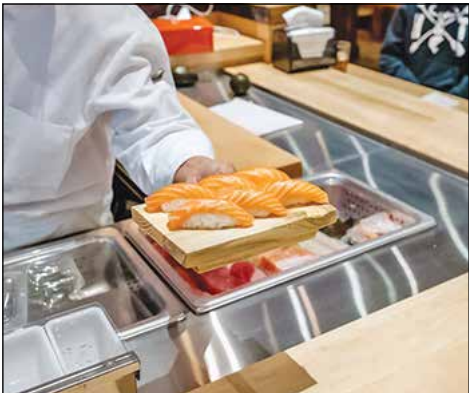
Chinuk Sushi & Grill, & el Pedro Taco is serving up two restaurant options in one convenient location in its first months of operation, just west of the East Troy Village Square.

The café, located in a renovated historic site from 1856, features a farm-to-fork menu and uses locally roasted beans with local, organic milk. For more information, visit 2894onMain.com.