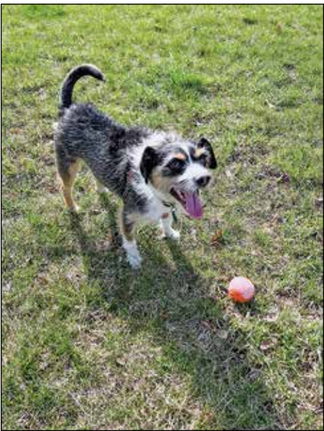
The East Troy Dog Park exercise areas are open from sunrise to sunset. There's a large dog area for dogs weighing 25 pounds or more and a small dog for those weighing less than 25 pounds. The Park is located next to the Village of East Troy Municipal Building at 2015 Energy Drive.

The Village of East Troy Dog Park, 2015 Energy Drive, is open from sunrise to sunset. The park features a large dog area for dogs weighing 25 pounds or more and a small dog area for those weighing less than 25 pounds. Visit easttroywi.gov for more information.