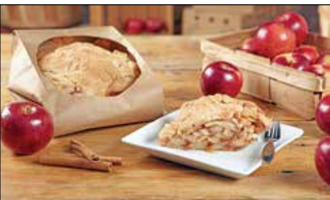
The Elegant Farmer Apple Pie Baked in a Paper Bag