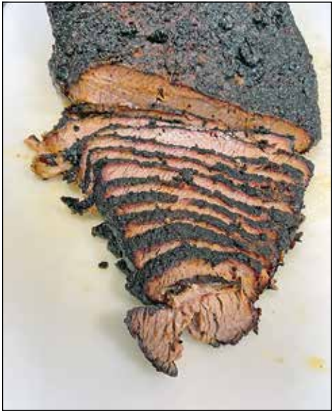
LD's BBQ Sliced Beef Brisket

LD's BBQ smokes its brisket low and slow over 100 percent seasoned oak wood and the melt in your mouth sliced beef brisket is bursting with flavor. The taste is no surprise as LD's BBQ, located in a 2,900-square-foot East Troy restaurant, 2511 Main St., has been named Best BBQ in Wisconsin and has a long list of accolades, including Food Network's list of "Best Ribs in Every State," #1 Restaurant in East Troy by TripAdvisor and Yelp, No. 6 on Milwaukee's A list on multiple occasions and Food & Wine Magazine's "Best BBQ Wisconsin." For more information, visit ldsbbq.com .