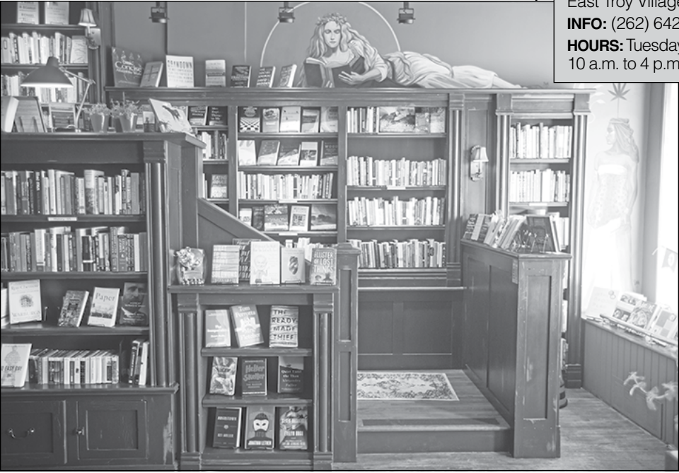
InkLink Books has captured the nostalgia of the best independent shops as vibrantly as possible offering spaces to browse, read and soak in the ambiance.